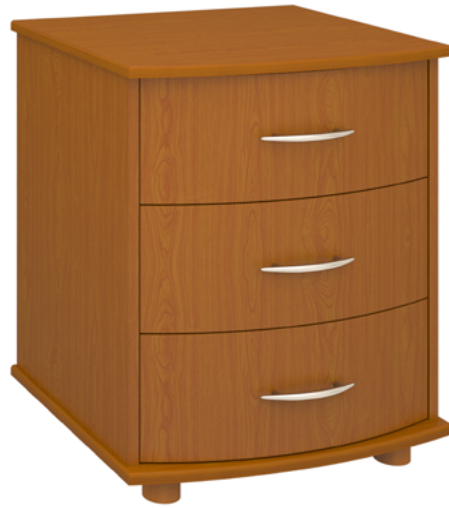
Model: CACH30 25W 21D 29H

Combining the romance of a bygone era with a contemporary twist, the fluid lines and sensuously curved fronts of the Camelot Collection bring a modern edge to a classic design. Select from a range of stylish hardware options to accentuate the sinuous curves.