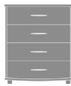
CACH40W 32.25W 21D 36H